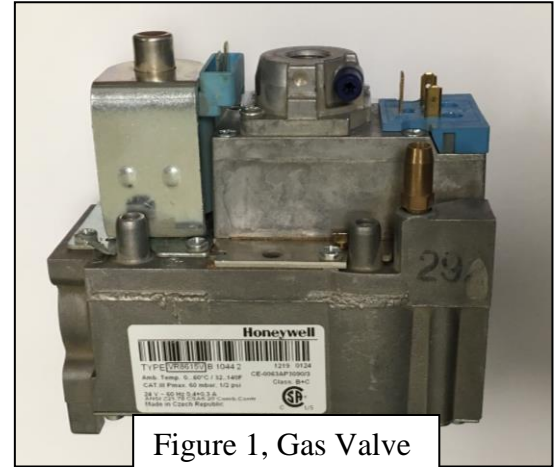
Figure 1, Gas Valve