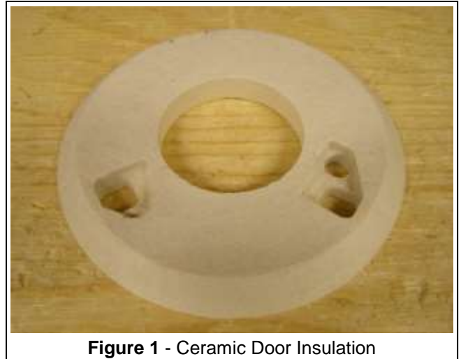
Figure 1 - Ceramic Door Insulation