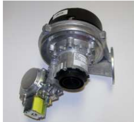
Figure 1 Gas Valve Assembly