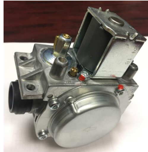
Figure 1 Gas Valve