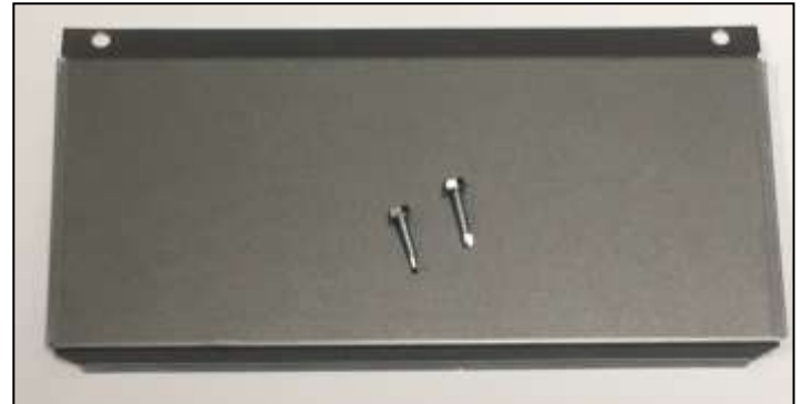
Figure 1 Drip Cover Kit