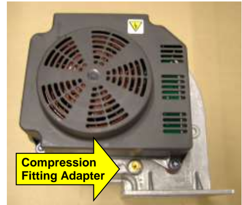
EBM Blower G1G170 (Lx600-800)

Refer to the replacement procedure below regarding how to disconnect the fuel-air metallic tubing from the compression fitting adapter on the blower (shown adjacent).