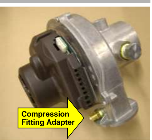
EBM Blower NRG137 (Lx500)

Refer to the replacement procedure below regarding how to disconnect the fuel-air metallic tubing from the compression fitting adapter on the blower (shown adjacent).