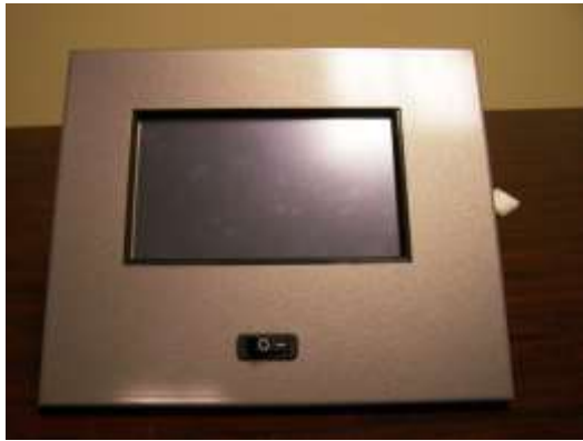
Figure 5: Tft Display assembly