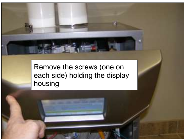
Figure 4: Lx screen housing