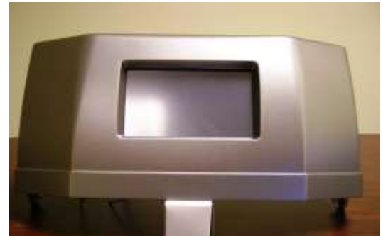
Figure 1: Lx Display assembly