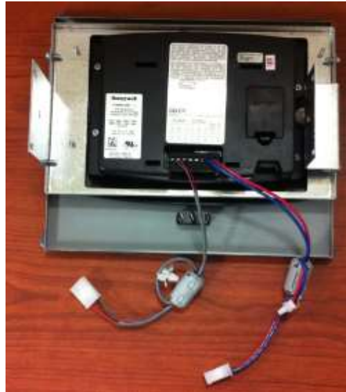
Figure 6: Tft Display (back)