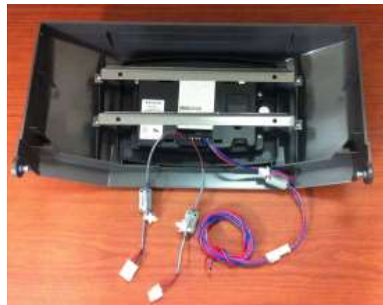
Figure 2: Lx Display (back)